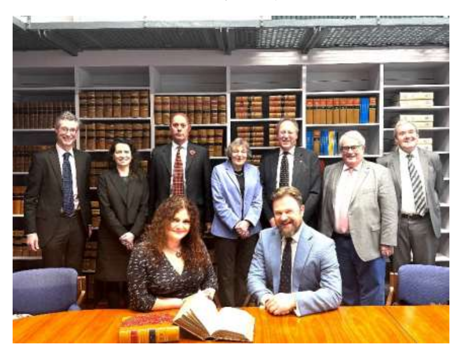
Gathering of representatives of law reform bodies of UK, Ireland and Jersey

In November 2023 we hosted the annual meeting of the law reform bodies from the UK, Ireland and Jersey. This was the first in person event since 2019, and it allowed us to deepen relations and contacts which had been maintained in the interim by means of virtual meetings. Although we have common goals and often work in similar legal areas we nevertheless operate with different backgrounds and processes, and sharing information in this way is mutually beneficial and efficient. Regretfully the Northern Ireland Law Commission, which is currently non-operational, was not able to be represented.