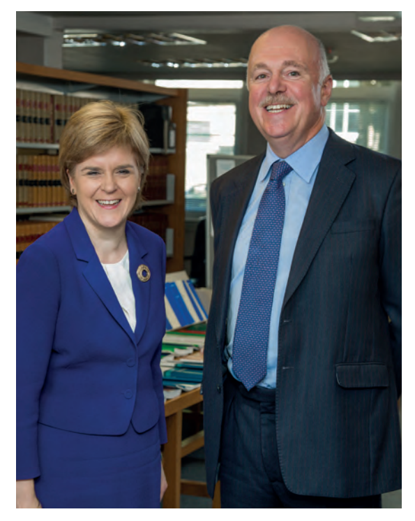
The First Minister, Nicola Sturgeon MSP with the Chairman, Lord Pentland

The Scottish legal system is a unique feature of Scotland. The Commission takes a forwardlooking approach to developing the law, so as to reflect the needs of modern society and in so doing retaining the integrity of Scots law.