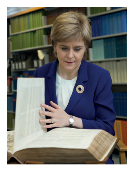
The First Minister in the Commission's library

by the First Minister, Nicola Sturgeon MSP.