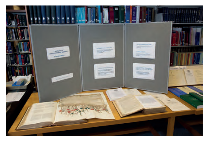
Display of Scotland's constitutional journey on law reform

The Commission's 50th anniversary was recognised by the Scottish Public Law Group which organised a special event in November, at the Laigh Hall in Parliament House.