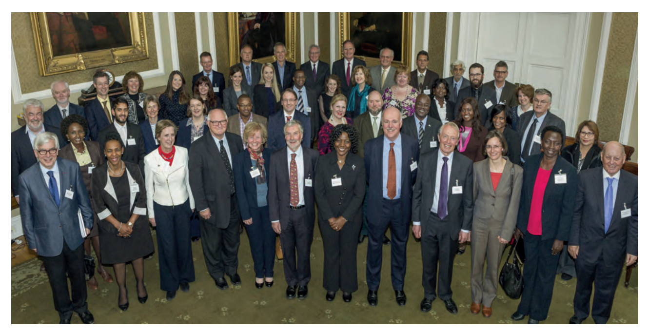
Delegates attending the Commonwealth law reform conference

The Commission took the opportunity at the conference to showcase recent law reform achievements in Scotland, including the establishment of a new procedure in the Scottish Parliament for