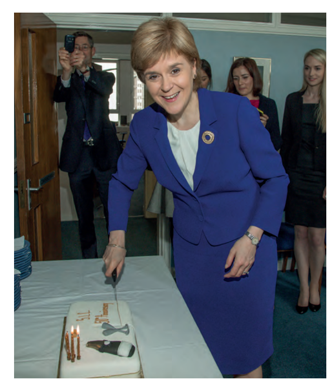
The First Minister met Commission staff and cut the 50th anniversary cake

The First Minister viewed a display of the Commission's work over the 50 years. She met