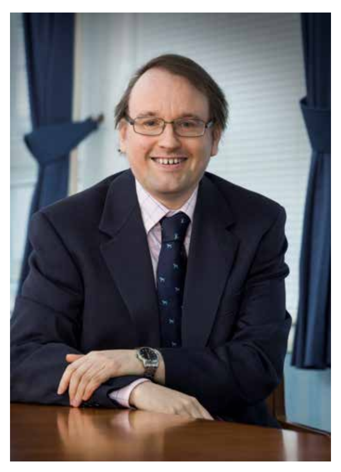
Dr Andrew Steven, Commissioner

Thus book debts (money owed but unpaid), loan books (sums due on mortgage, credit cards, car loans etc), intellectual property rights (patents etc), stock in trade, and equipment (vehicle fleets etc) all fall within the scope of the project. The project does not cover the transfer of corporeal moveable property, a subject that is mainly covered by the Sale of Goods Act 1979.