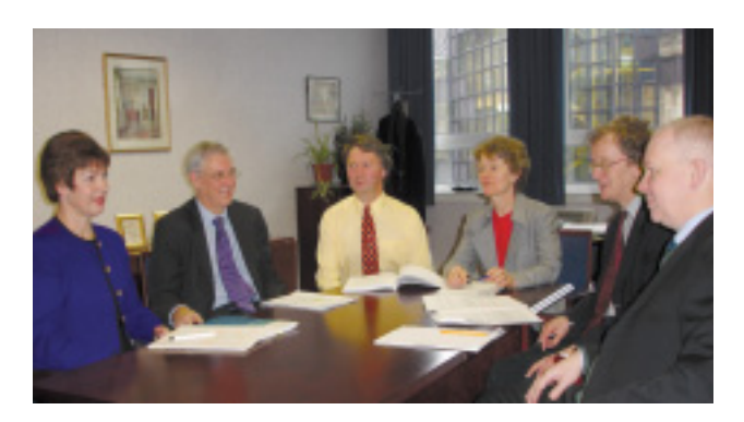
Chief Executive and project managers

Commissioners and the Chief Executive are assisted by legal and non-legal staff.