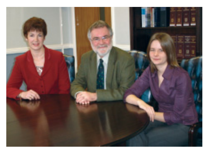
Judicial factors team

We aim to publish a discussion paper in 2006.