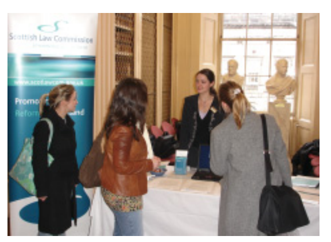
Edinburgh law fair

We have set up a team to revise our present environmental policy, in line with our duty to further the conservation of biodiversity under the Nature Conservation (Scotland) Act 2004. We will be identifying objectives and setting annual targets, aimed at improving our performance in areas such as energy use, water and paper consumption, waste disposal and official use of transport.